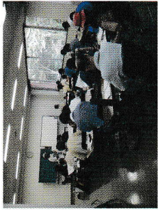
Natural environmental study