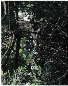
Young and parent of Goshawk