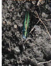
Yamato Jewel beetle